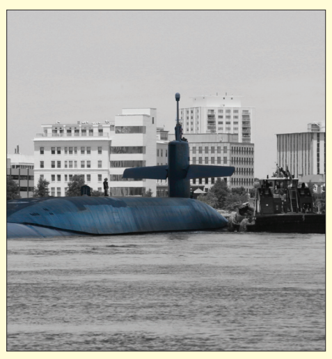
Left, Norfolk Naval Shipyard (NNSY) finished work on the Philadelphia (SSN 690) in August completing all inactivation work after approximately 100,000 mandays. Center, USS Dwight D. Eisenhower (CVN 69) transits the Elizabeth River after Norfolk Naval Shipyard (NNSY) completed its Planned Incremental Availability June 13. Right, USS Tennesee (SSBN 734) departs for sea trials July 18 after 400,00 man-days of work at NNSY during its Engineered Refueling Overhaul.

The second quarter at Norfolk Naval Shipyard (NNSY) saw the completion of two availablities, USS Dwight D. Eisenhower (CVN 69) and USS Tennesee (SSBN 734) and the continuation of the deactivation of Philadelphia .